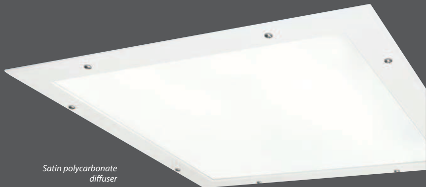
Satin polycarbonate diffuser